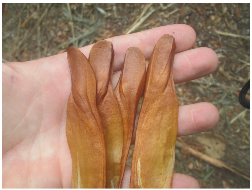
Big leaf mahogany produces winged seeds in February - March.