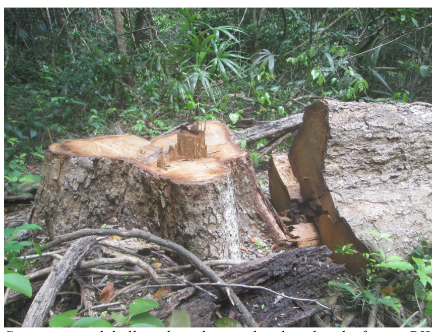
Some trees with hollowed trunks are abandoned in the forest. RIL techniques to test for wood quality can help to reduce waste and minimize complications in permitting.

forest management within the following criteria: minimization of ecological damage and carbon emissions from forestry operations; maintenance of forest health, structure and composition; and maximization of the long-term value of the forest resource for ejido members. Our analysis included an overview of biophysical conditions in the Yucatan region, common silvicultural practices, and regeneration of commercial species. In our site visit, we observed areas of timber harvest to identify existing regeneration patterns and predict likely obstacles and costs to implementing RIL techniques. We also spoke with several foresters and community members involved in forest operations and use. Our analysis incorporates this information with current practices in reduced impact logging and tropical forest management.