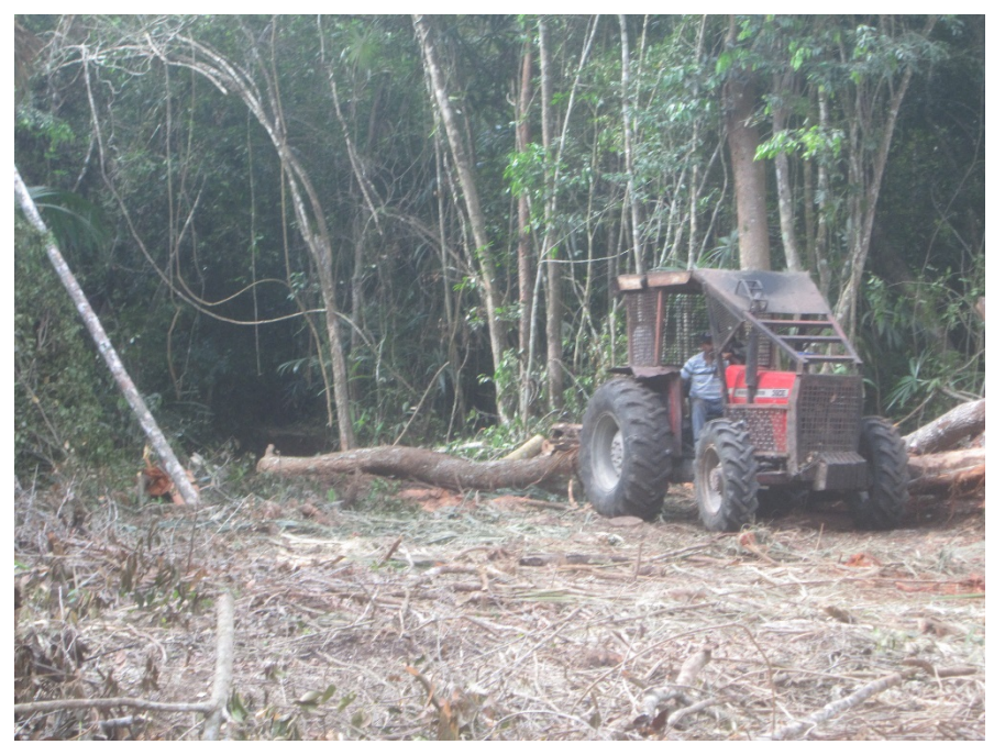
Forestry practices in the region are already low impact. Here a modified tractor-skidder hauls a log to a landing area.

Finally, in the larger landscape context, agricultural use and road conditions are an important component of forest management in rural communities such as these. The Maya forest region is a seasonal dry tropical forest, with the majority of the 1,000 -1,500 mm annual precipitation falling in the months of July - December. In some communities, impassable roads make timber harvest impossible in the wet season. In addition to lost revenue, restricted access also reduces the opportunity to practice active management techniques such as weeding, liberation cuttings, and patch clearings. Roads and access also impact agricultural and agroforestry practices in forest areas. Mexican land use zoning restricts traditional shifting cultivation practices known to the Maya ( milpa systems) that produced periodic forest clearings and historically favored light demanding species such mahogany and cedar. We recommend that current policy makers consider land use options of tree fallow management and agroforestry systems that facilitate greater tree cover, timber management, and a diverse range of traditional crops.