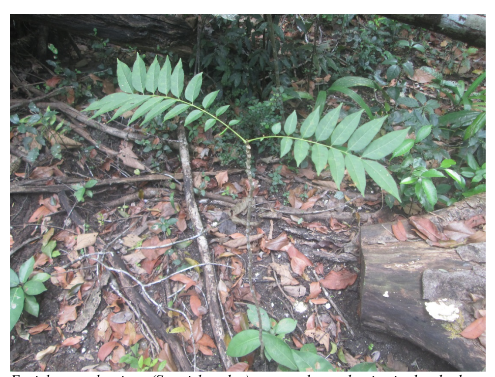
Enrichment plantings (Spanish cedar) are rarely productive in the shade.

However, implementation of selected RIL techniques could facilitate retention of forest carbon stocks while also encouraging regeneration of commercial species. RIL techniques could reduce waste wood and better manage roads and skid trails with road planning and harvester training. Selected log landings could be increased in size to ensure greater growth and regeneration of commercial species. The greater biomass removal associated with the widening of these