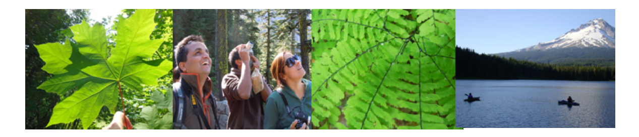
Register Now for

allow addressing the challenges in achieving a balance between biodiversity conservation and sustainable utilization of forest resources. For the proposed session we have institutional support from IUFRO Division 4 in general and the IUFRO Units 4.02.07, 4.03.00, 4.03.03, 4.04.04, 4.04.06, 3.04.01, as well as Society of American Foresters Working Group Land Use Planning, Organization and Management (SAF-E2), the EURO Working Group of Operations Research in Agriculture and Forest Management and Section on Energy, Natural Resources, and the Environment (ENRE) of the Institute for Operations Research and the Management Sciences (INFORMS) and the European Land Use Institute (ELI).