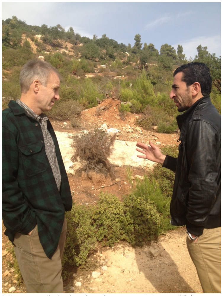
Meeting with the local ecologist at a 27 year old fire scar, Dibeen Forest Reserve

I visited, assessed, and developed recommendations for the management of fire at three reserves managed by the Royal Society for the Conservation of Nature (RSCN), Dibeen, Ajloun and Yarmouk. These site visits included a general orientation, examination of old fire sites, and discussions on suppressing fires and post-fire rehabilitation. A training workshop with the RSCN, the Forestry Department/Ministry of Agriculture, Civil Defense, and the Environmental Rangers was held to assess fire suppression preparedness and practices, safety procedures, and interagency cooperation. It was also an opportunity to introduce the idea of using fire as a tool to reduce the likelihood of fire. I gave a presentation on fire, both fire suppression and use, in the southern U.S.